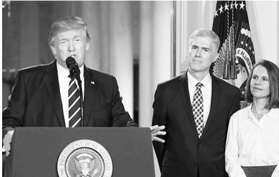
President Donald Trump nominating Judge Neil Gorsuch on January 31, 2017.

"But then again, this isn't really about the nominee," McConnell said. "The opposition to this particular nominee